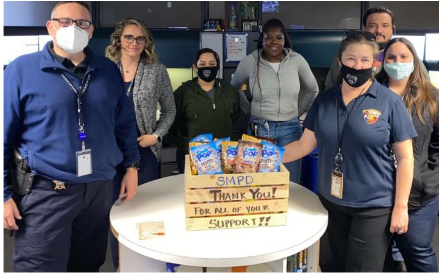
Left and above: Employees from the Hays County Sheriff's Office and Kyle Police Department deliver thank-you baskets to the San Marcos 911 Center for their help and accommodation during the winter storms.