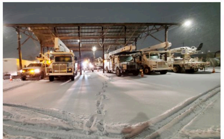
Top left: A SMEU employee repairs damage caused by the winter storms. Top right: SMEU employees take a break from the ice and snow. Bottom: Snow covers the SMEU fleet during the winter storms.