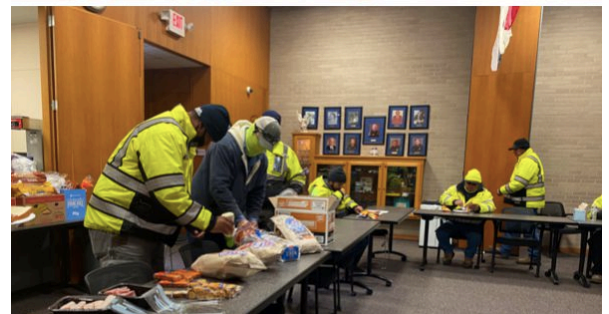
Collection: Employees from the Neighborhood Services Department pack food into bags and deliver meals to community members sheltered in hotels during the winter storms.