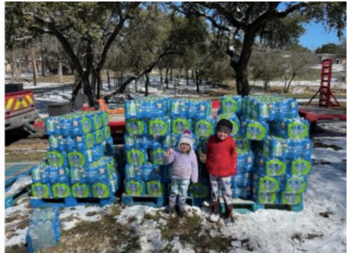
Above left: City employees unload a SMFD truck loaded with cases of water to provide to the community. Above right: Young volunteers pitch in to pass out water to the community.