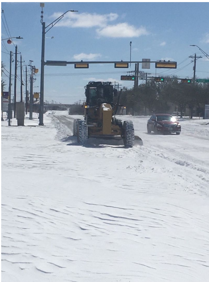
Above: A City of San Marcos Transportation worker plows snow covering Sadler Drive.